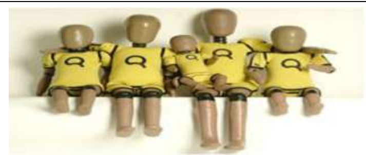
Figure 1: Q series child dummy

About car seat forward frontal impact safety performance analysis