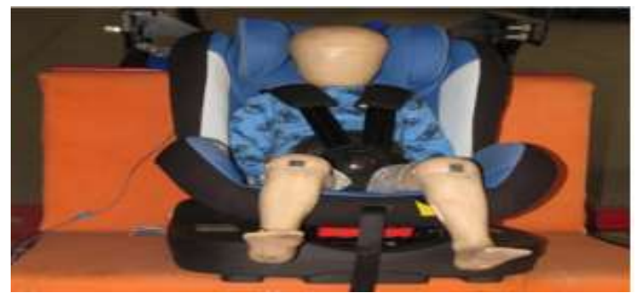
Figure 2: the child restraint system frontal impact safety performance test

Collision safety evaluation using dummy model for Q1.5, Q3, Q6 and Q10, of which this article before to fake the frontal crash test selected for Q3 dummies, test seat Angle of 0 degree, test process are shown in figure 2 below, slow down the car test waveform is shown in figure 3